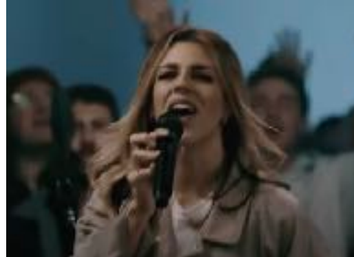
That's the Power Hillsong Worship